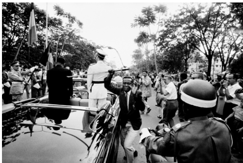
A Congolese man snatches the sword from King Baudouin of Belgium Leopoldville 1960

Berliner Originale VOL. I: Robert Lebeck