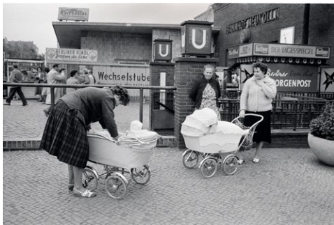
Karl-Marx-Strasse, Berlin-Neukölln 1960