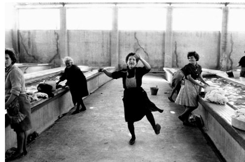
Washerwoman in Cullera, Spanien 1964