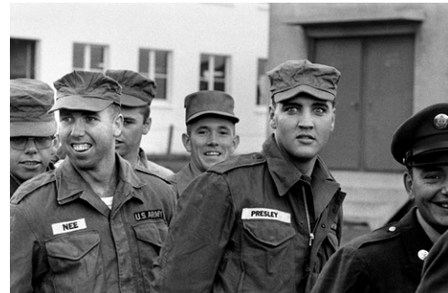
Elvis Presley in Friedberg, Hesse 1958