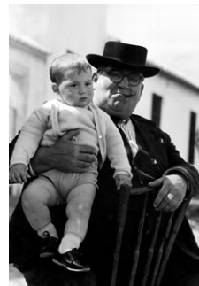
Grandfather and grandson in Sevilla, Spain 1964