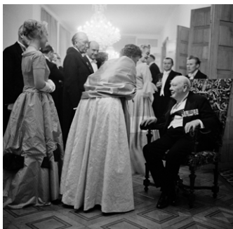
Konrad Adenauer receiving Winston Churchill at Palais Schaumburg, Bonn 1956