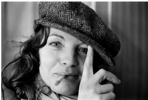
Romy Schneider during a break in filming, Berlin 1976

Berliner Originale VOL. I: Robert Lebeck