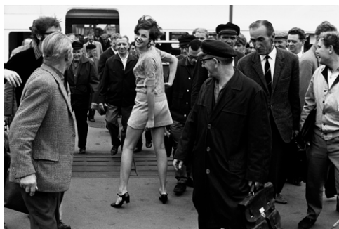
At the Landungsbrücken in St. Pauli, Hamburg 1963