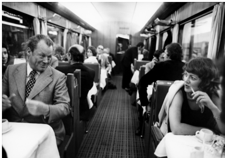
Willy Brandt in the dining car while on an election campaign tour, southern Germany 1973