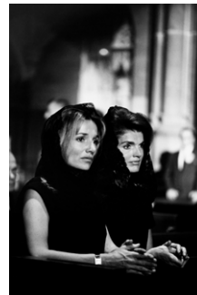
Jackie Kennedy and Lee Radziwill at the coffin of Robert Kennedy, New York 1968