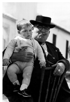
Grandfather and grandson in Sevilla, Spain 1964