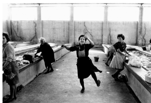
Washerwoman in Cullera, Spanien 1964