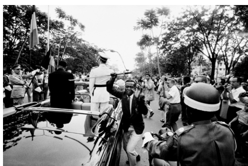
A Congolese man snatches the sword from King Baudouin of Belgium Leopoldville 1960

Berliner Originale VOL. I: Robert Lebeck