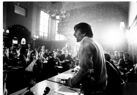
Rudi Dutschke during his speech at Charles-University, Prague 1968