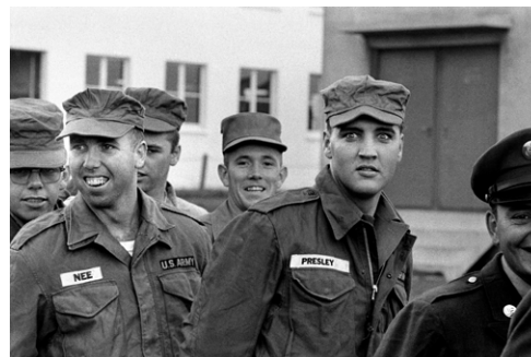
Elvis Presley in Friedberg, Hesse 1958